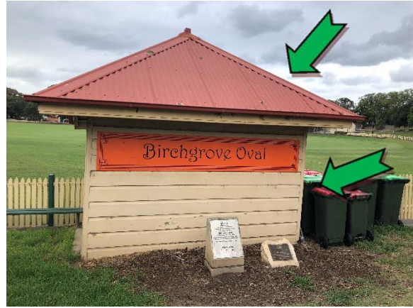
Photo 2. Exterior, walls, guttering and roof – suspected lead-containing beige and red paint systems.