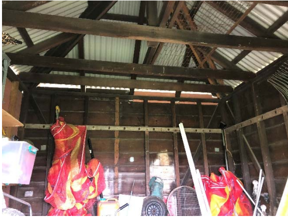
Photo 1. Interior, structure and roofing – non asbestos-containing materials.